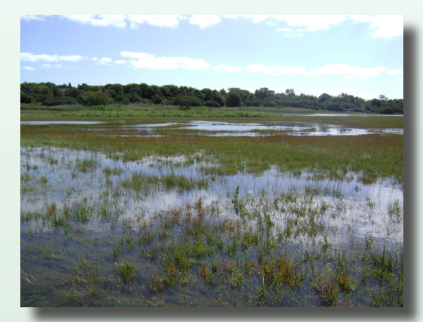
Flooded Coastal Plain

• Modeling and Experimental Research to Guide Management of Community Adaptations in the South Atlantic Coastal Plain in Response To Climate Change And Sea Level Rise. This project will use a combination of field sampling, species distribution modeling, and targeted experimentation to assess the potential influence of climate change and sea level rise on target communities in the lower coastal plain.