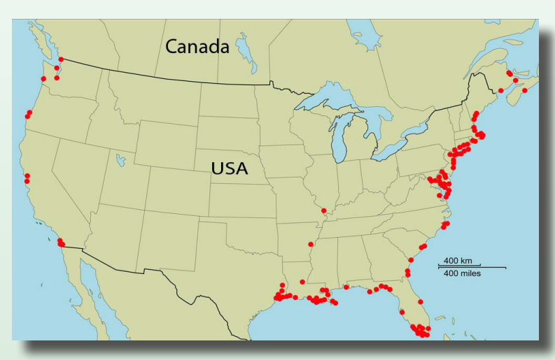
SET locations in North America

• NCCWSC - Integrated Coastal Assessment for the Southeast. The approach taken is to install Sediment Elevation Table devices (SET) and accretion monitoring plots in seven northern Gulf coastal wetland sites from Biloxi, MS to Mobile, AL.